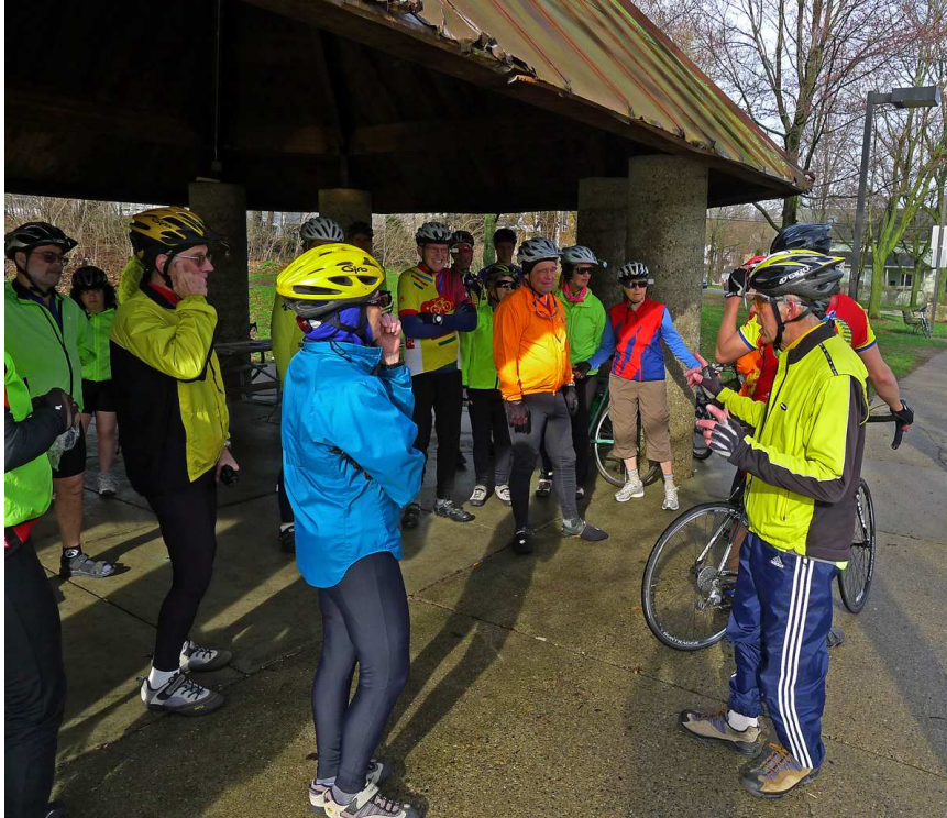
AABTS Saturday Riders Take Instructions from the Captain at Wheeler Park on a Cool April Morning

and a post-event report on the Tour de Kids in the next newsletter.